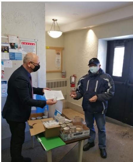
Holy water pick up on January 19

Second, I want to say how proud I am of our CYMKivtsi for delivering Svyata Vechera, to many of our shutins and seniors. It was a great idea and a wonderful way to connect and show that our youth are filled with compassion and love for the people who belong to their church. We could not reach everyone we hoped to, but maybe this is something we can build upon in the future. But the bottom line is: CYMKivtsi....YOU ROCK!