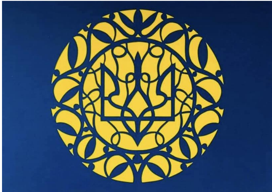
Tryzub by Daria Alyoshkina

With Russia's troops amassed at Ukraine's borders, and alarming daily news of an imminent further invasion, can Ukraine and the international community deter further Kremlin's aggression? What is the reality on the ground and what are the likely future scenarios?